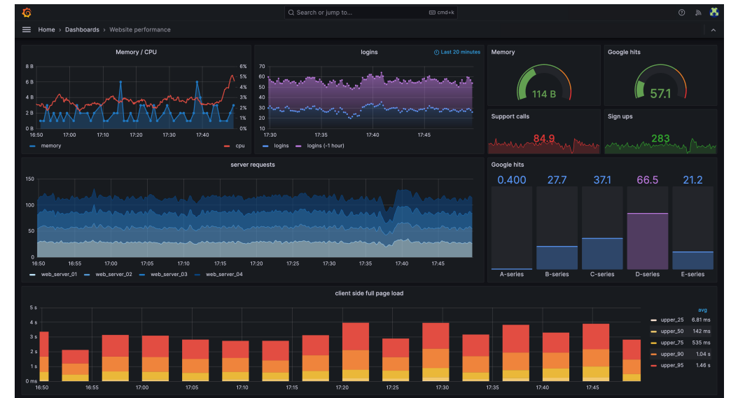
Example Grafana page

I created some toy data in PSQL database and show it on the Grafana page