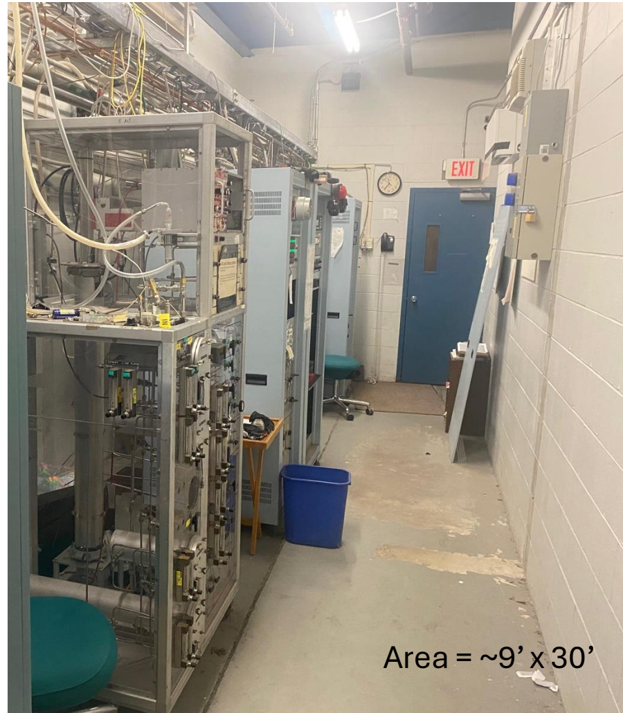
Gas Room ~75 feet from IR