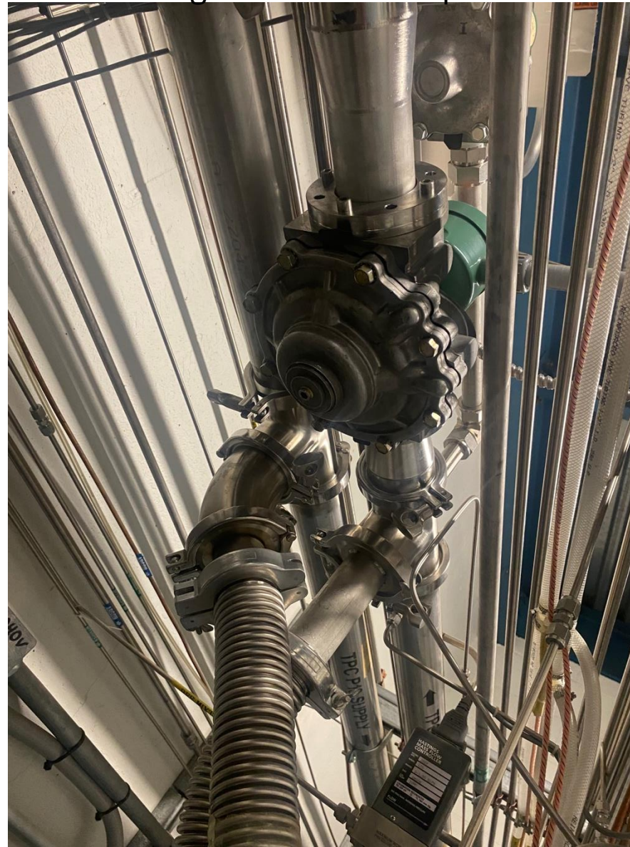
Supply and return lines, from the gas mixing cabinet, the solenoid valve is for venting the excess/overpressure