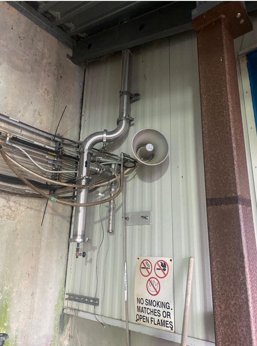
TPC gas vent line, in the gas pad