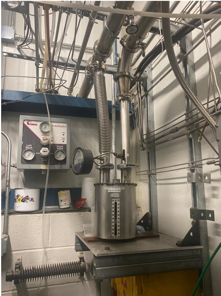
Over pressure bubbler