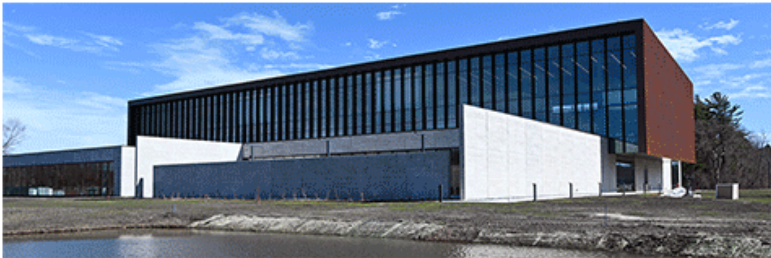
Science and User Support Center (Bldg. 101)

Venue: New Science and User Support Center (SUSC)