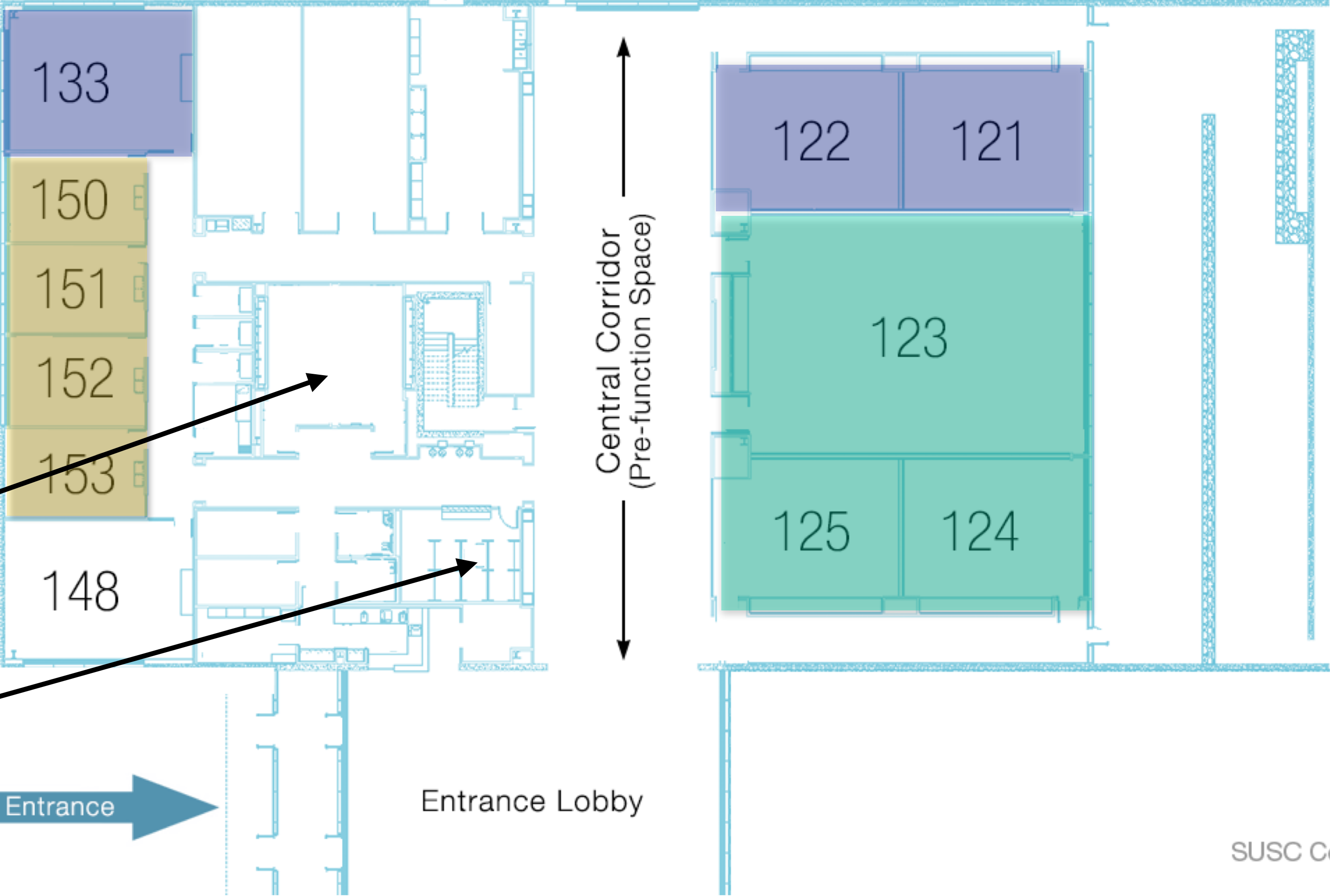
Science and User Support Center (Bldg. 101) Floor Plan