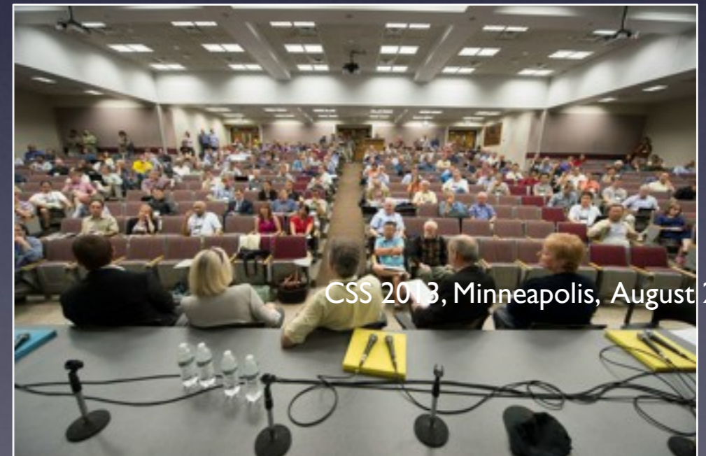
CSS 2013, Minneapolis, August 2013