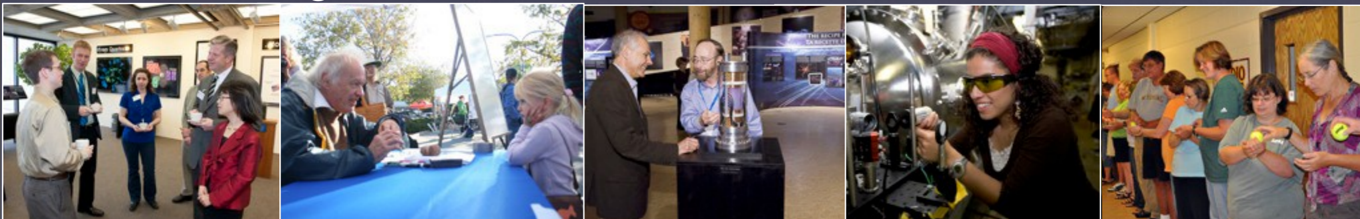
CSS 2013, Minneapolis, August 2013

We must recognize—formally and informally—the importance of the CE&O work of our colleagues, postdocs and students and encourage that work to continue.